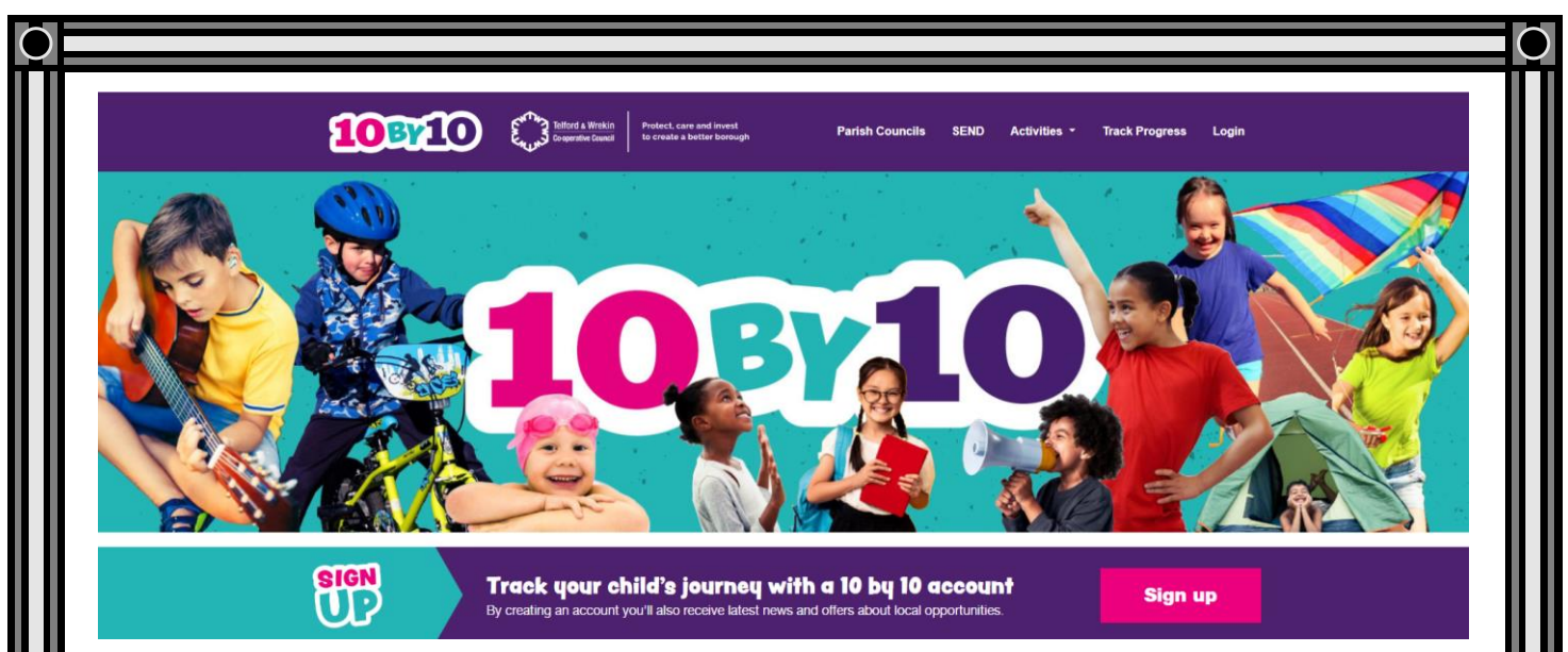
Nearly 1,000 children have registered with 10 by 10

Schools, parents and children have taken part in 10 by 10 since the new website launched in September 2022.